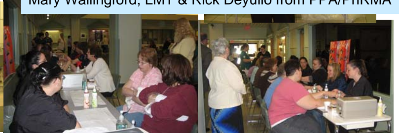
Once again the students and teachers from Madison-Oneida BOCES Cosmetology, Secondary & Adult Nursing, and Culinary Arts Programs treated the 120 attendees to paraffin hand waxing & massages, wellness checks, and preparing & serving the breakfast and luncheon.