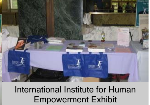
International Institute for Human Empowerment Exhibit

For more information and additional photos on the NYS Awareness Event please visit our website www.nolupus.org