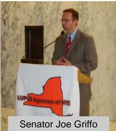
Senator Joe Griffo