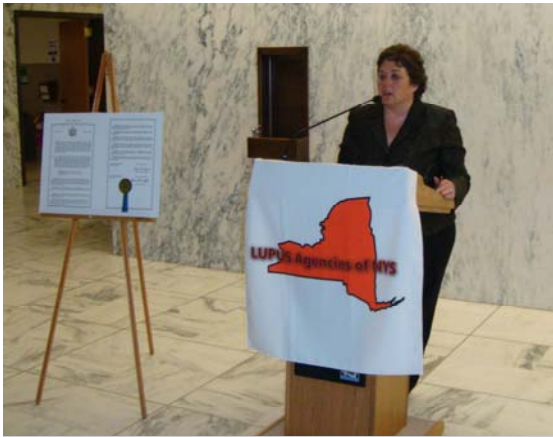
Assemblywoman RoAnn Destito