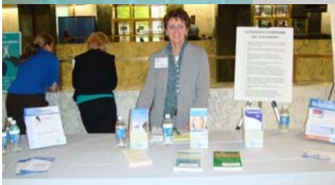
Sjögren's Syndrome Foundation (above) and Scleroderma Foundation (right)