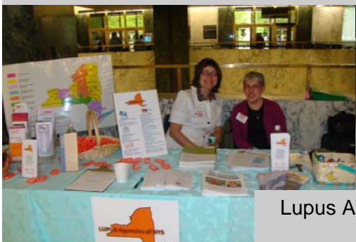
Lupus Agencies of NYS Exhibits and Volunteers