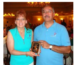
Gold Sponsors UFCW Local One & Teague Accounting

Thank you to our 2010 sponsors, golfers, prize donors, ticket sellers, volunteers, and supporters for making this event possible.