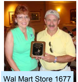
Wal Mart Store 1677

Thank you to our 2009 sponsors, golfers, prize donors, ticket sellers, volunteers, and supporters for making this event possible.