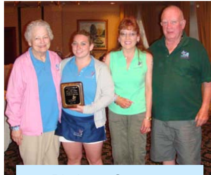
Platinum Sponsor Mitchell Family & MCORP