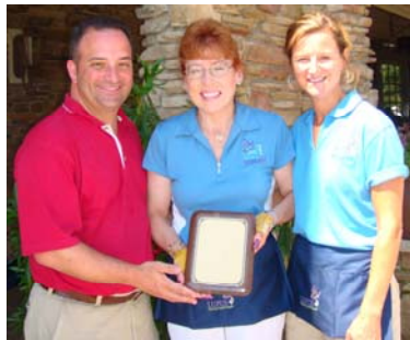
Tournament Sponsor Pfizer