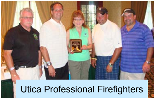
Utica Professional Firefighters