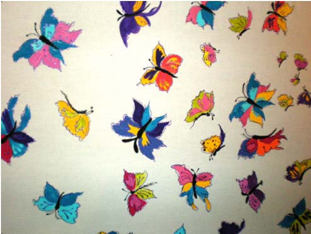
Closer detail of new backdrop